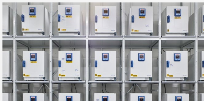
Ovens in the Trelleborg Sealing Solutions Material Laboratory are used to test materials for compatibility with CIP media.

FoodPro® EPDM materials demonstrate long life in polar media and excellent compatibility with alkaline cleaning agents, retaining hardness and tensile strength, while exhibiting little volume change.